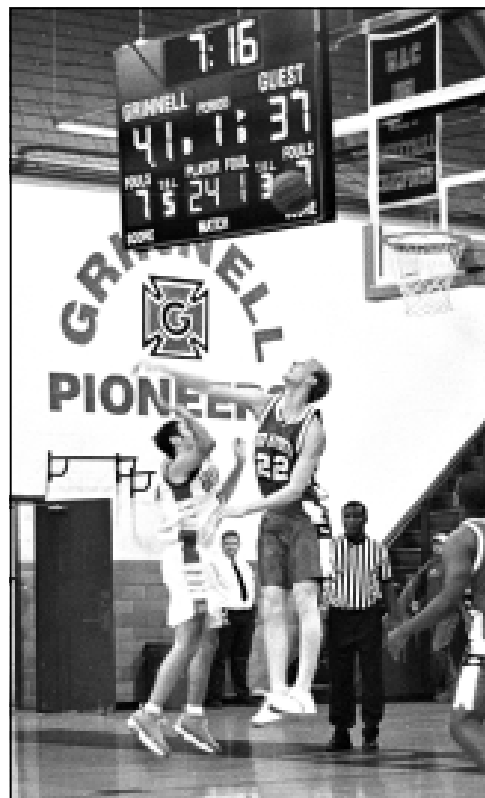
From zero wins in '02 to 10 in '03: dare we mention the playoffs for women's basketball in '04?