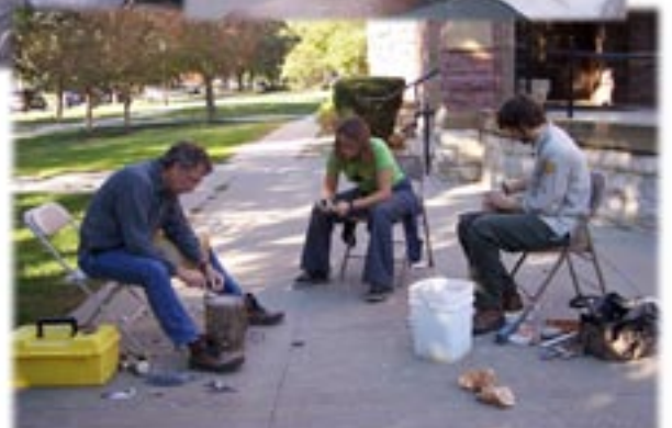
Acorn taste tests; Atlatl team at Cahokia; Flintknappers in front of Goodnow; Anthropology pot luck on the lawn.